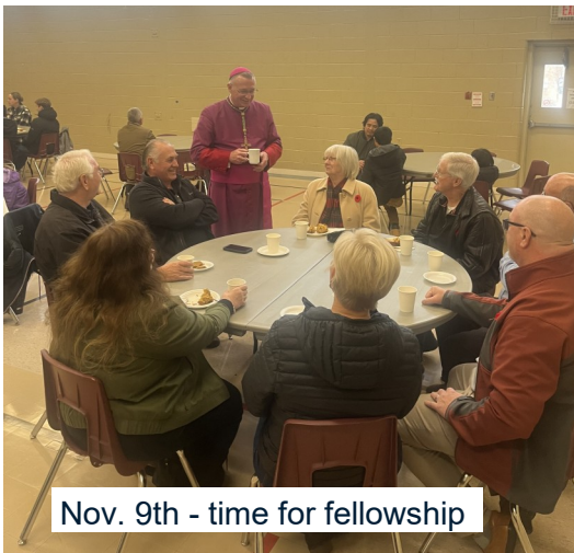
Nov. 9th - time for fellowship