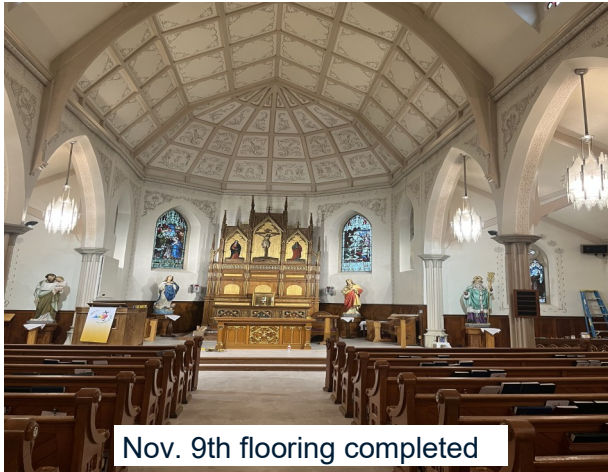
Nov. 9th flooring completed