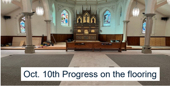
Oct. 10th Progress on the flooring

Let us pray that those who are tempted to commit suicide might find the support, care and love they need in their community, and be open to the beauty of life